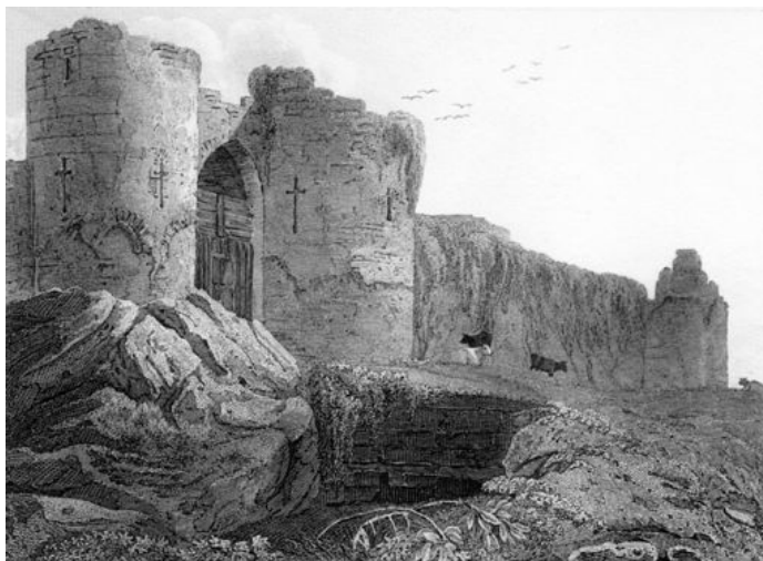
Beeston castle, the Inner Bailey Gatehouse, from an early 19th century engraving

The Constable would have had a number of people who worked beneath him. There was the garrison, whose members would vary in status, and could include, knights, men-at-arms, archers, and engineers. He was also responsible for the grooms, watchmen, porters, cooks, and even the scullions, who did the washing up in the kitchen. 12