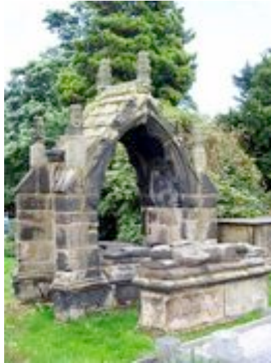
Medieval Brereton tombs at Astbury church

( www.thornber.net/cheshire/htmlfiles/astbury.html )